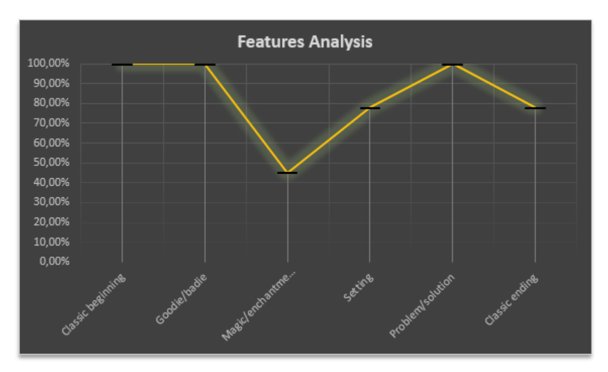
Graph 1: Features analysis

The analysis of the students' writing made it possible to determine which elements of the Fairy Tale are recurrent, as shown in the graph below. The graph gives an overall view of the students' performance on the final task. Even though not all features were used in every written text, they still present elements that enable us to consider them as belonging to the fairy tale genre.